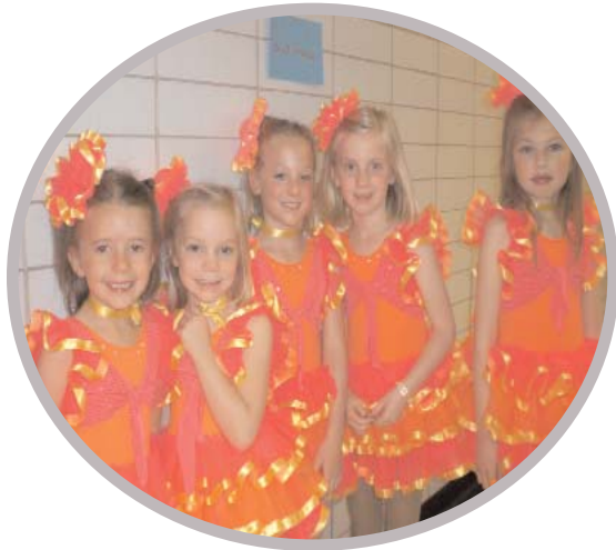
Anxious to go on stage at annual recital